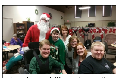
MO-YLF alumni at a holiday party in Kansas City

Every year, Alumni return to the Missouri Youth Leadership Forum to serve as volunteer staff and mentors. Missouri Youth Leadership Forum is what it is today because of the involvement of its Alumni. If your organization is interested in a MYLIFE